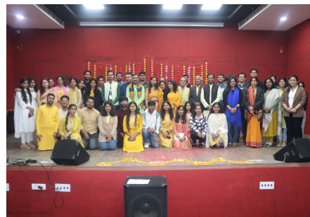
Faculties and Students during the event

JIMS Greater Noida on the occasion of Basant Panchami organized Vasant Utsav on 14th February 2024. The event began with Saraswati Puja to seek blessings from the Goddess Saraswati followed by havan, prasad distribution and cultural performances by students.