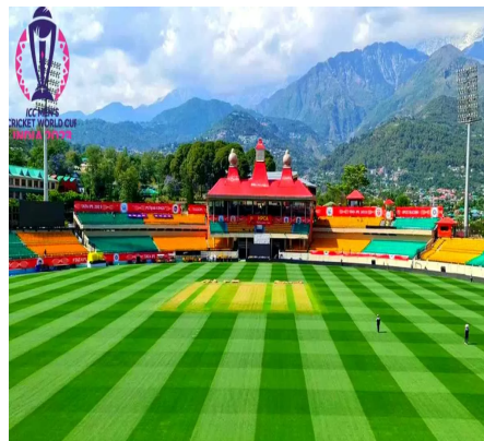
World's highest cricket stadium in Dharamshala