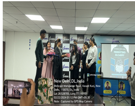
Winners being felicitated

Entrepreneurship and Innovation Vertical of CII YI YUVA Club, JIMS Vasant Kunj organised "Marketing Alchemy," on 22nd February, 2024. The participants presented their revamped products, each performance weaving a unique tale of transformation.