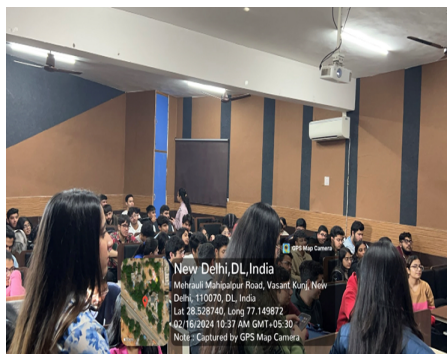
Students during the event

Prabandhan, Management Club, JIMS Vasant Kunj I organized intra-college event 'Ad Mad Show' on 16th of February, 2024. The event was an advertisement competition centered around the theme of presenting different advertisement for products.