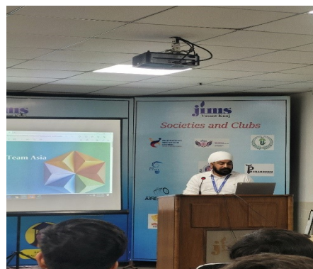
Students during the event

Prabandhan, Management Club, JIMS Vasant Kunj I organized Intra-college event 'TASKs TakeDown' on 27th February 2024. The event focused on planning and effective execution of the tasks given to the students. It was a challenging yet rewarding experience as various lessons are learned like meticulous planning and agile problem-solving skills.