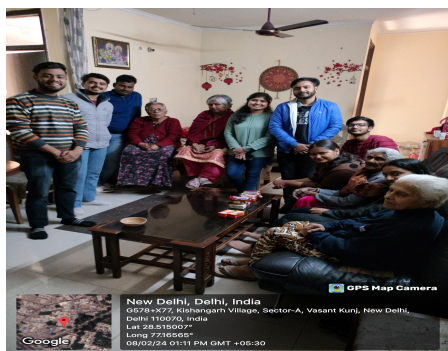
Students at the old age home

Rotaract Club, JIMS Vasant Kunj I organised Old Age Home Visit on 8th February, 2024 at Aashiyana for senior citizens, Vasant Kunj. They played many games like Tambola, Chinese Whisper, and Dumb Charades, and distributed snacks as game prizes.