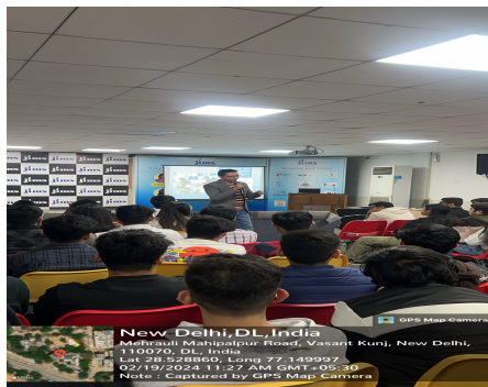
Guest addressing the audience

Department of Media and Communication Studies, JIMS VK organized industry visit to 'Media Conclave' held at Ashoka Hotel, Chanakyapuri on 27th February, 2024. The event covered discussion regarding upcoming Election 2024 and saw the likes of Home Ministry (Amit Shah), Defence Ministry (Rajnath Singh) along with Chief Minister of 15 different states. The students came to know the views of the eminent personalities on the subject.