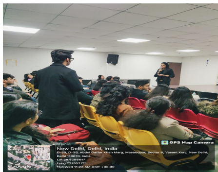
Guest interacting with students