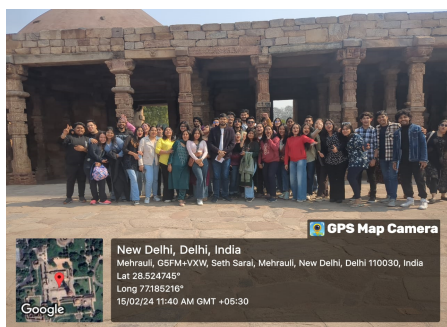
Students during the visit

Department of Media and Communication Studies, JIMS VK organized industry visit to 'Qutub Minar and Archaeological Park' for students of I Semester on 15th February, 2024. Students clicked photographs of the various places of the monument and park which helped them understand the nuances of photography. They also learnt the functioning of camera and the different types of exposure and how they have to be used according to the environment and lighting of the area.