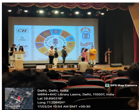
Students during the visit