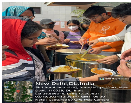
Students during the food donation drive

CII YI YUVA Club, JIMS Vasant Kunj I organised Food Donation Drive "AHAAR 3.0" on 19th February, 2024. Focused on extending a helping hand to the underserved, this charitable drive aimed to brighten the lives of those in need by providing free meals outside AIIMS, New Delhi. Noteworthy for its collective effort, each student contributed a nominal amount, showcasing their commitment to social causes.