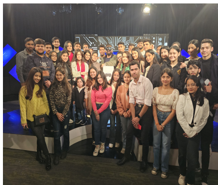
Students during the club activity

Department of Journalism and Mass Communication, JIMS VK II organised industry visit to NDTV on February 14th, 2024. During the visit, they had the opportunity to attend a taping of the show “Tech With TG” hosted by Technical Guruji Aka Gaurav Chaudhary. The episode began with the unboxing of the Apple Vision Pro Headset, which is currently available only to customers in the US. As audience members, students were able to share their opinions and ask questions.