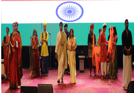
Glimpses of ZEST 2024

JIMS VK- Guest Lecture: Emerging Trends in Media and Entertainment Industry