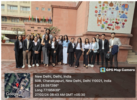
Students at the venue