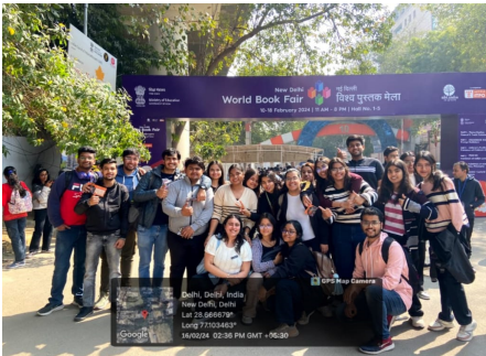
Students during the visit