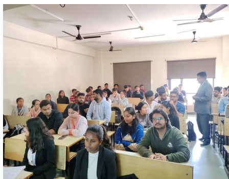
Guest Lecture in Progress