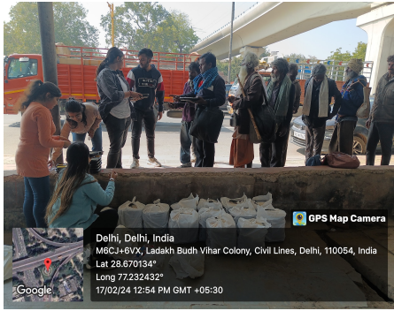
Students during the food donation drive